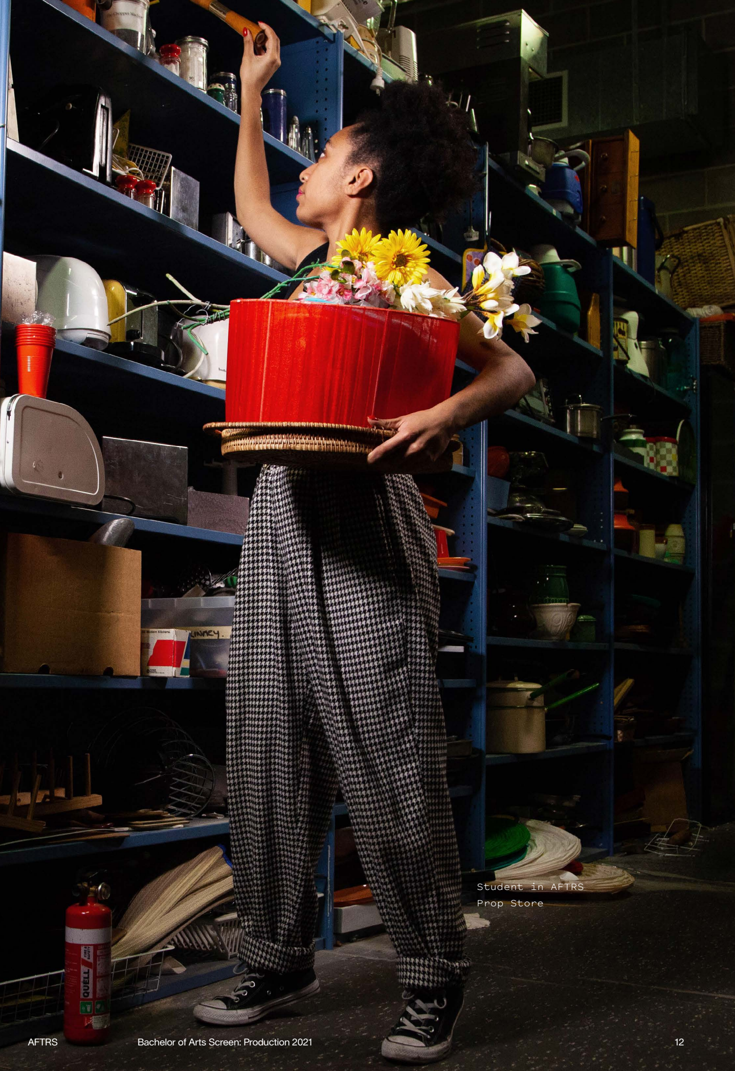
Student in AFTRS Prop Store