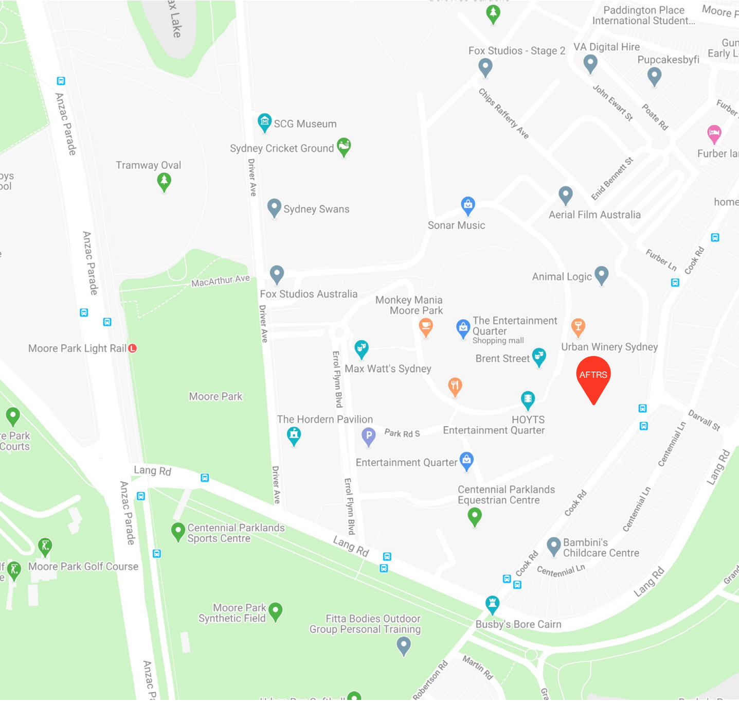
➤ AFTRS Location via Google Maps